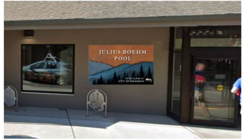
city facility facade signage