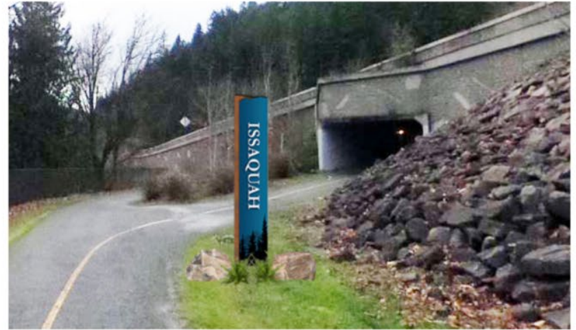
city gateway signage (waterfront/regional trails)