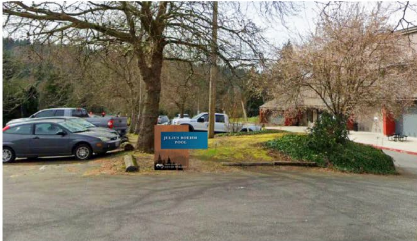
city facility directional signage