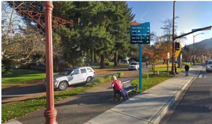
regional trail / shared use path directional signage