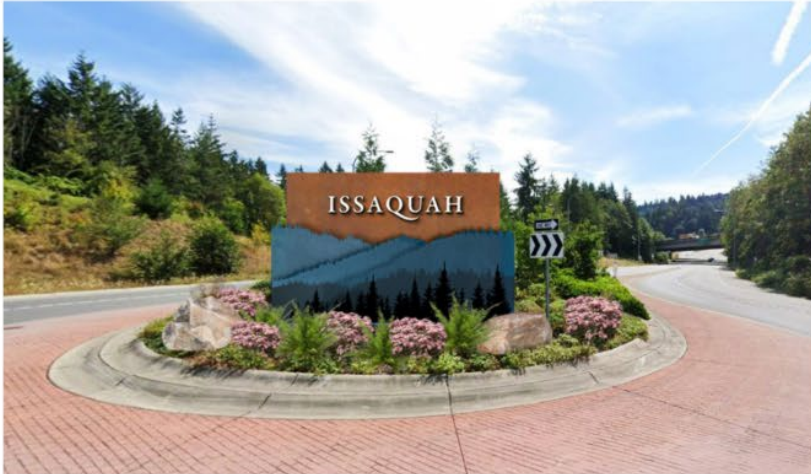
city gateway signage (monument)