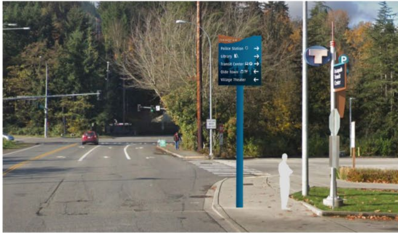
major routes directional signage