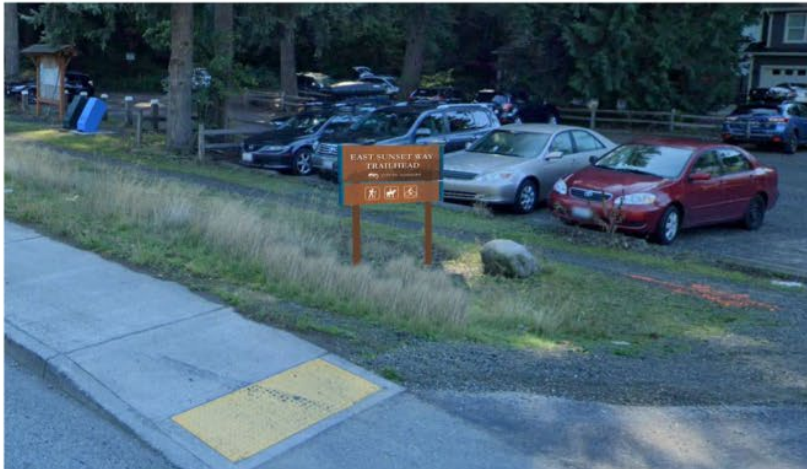
recreational trailhead signage