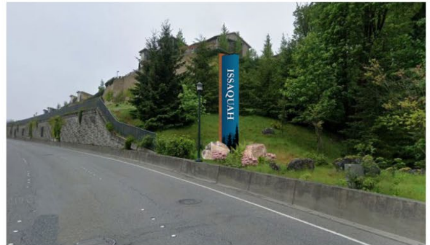
city gateway signage (vertical)